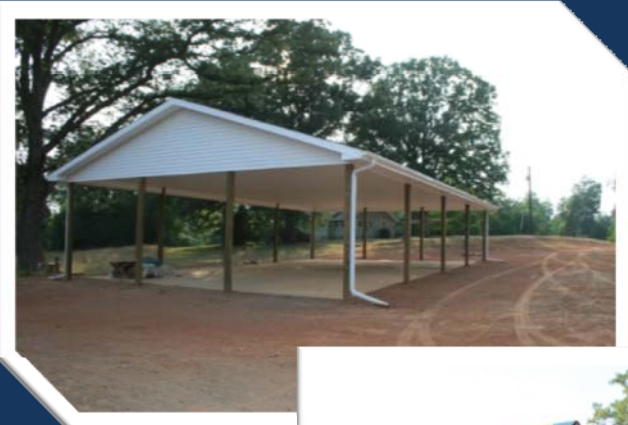
Above: Picnic Shelter Right: Playground